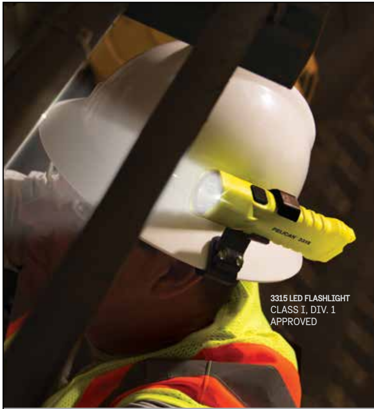
3315 LED FLASHLIGHT CLASS I, DIV. 1 APPROVED