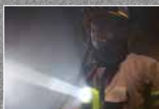
RIGHT ANGLE LIGHTING