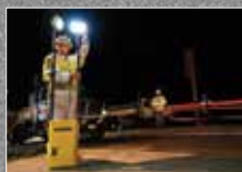
LED AREA LIGHTS

All trademarks are registered and/or unregistered trademarks of Pelican Products, Inc., its subsidiaries and/or affiliates.