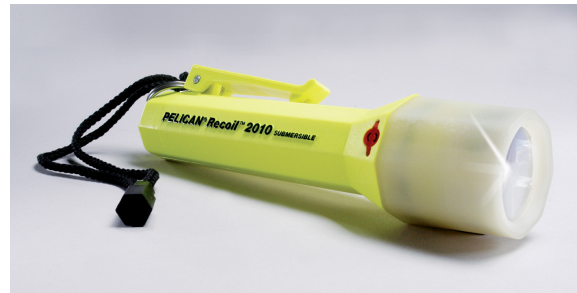
2010PL SabreLite Recoil LED

Class I II III Division 1 Groups ABCDFG T4 (Energizer), T3 (Duracell & Panasonic)