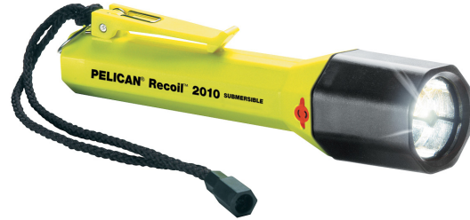
2010 SabreLite Recoil LED

The Pelican 2010 SabreLite LED Recoil now has Edison Testing Labs - ETL Class I II III, Division 1 Approvals (for gas, dust & fiber/flyings).